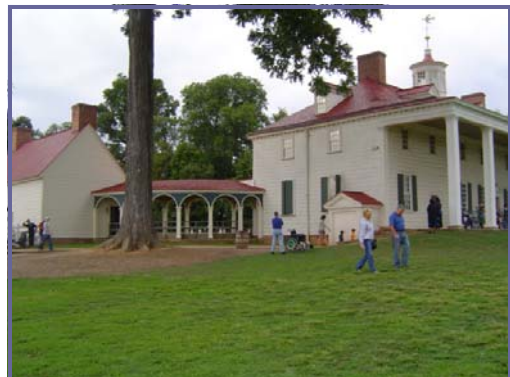
Adult Summer Reading bus trip to Mt. Vernon.

In March, the Golden Duck Production actors were back for another Murder Mystery Theatre in support of The Big Read, which was Fahrenheit 451 by Ray Bradbury. The play, entitled Who Killed Moby Dick? , highlighted the classics and characters from many different books. Stone Soup Books provided the desserts and we had about 50 patrons in attendance; everyone had a good time.