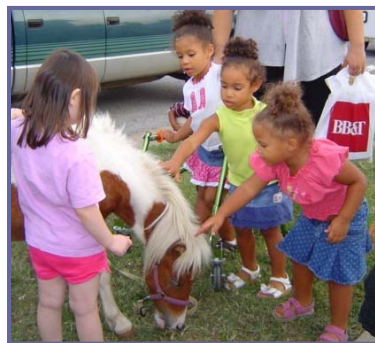
A petting zoo was a part of Fun Fest '09.

Programming for young adults included a murder mystery game, regular gamers' lounges (including Rock Band and new Wii gaming nights), numerous craft nights in which teens brought one large item such as flip flops or a discarded book to decorate, a cake decorating class, and a summer young adult reading club.