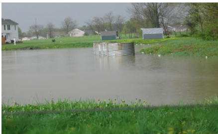
City staff will inspect detention ponds to make sure the facility is operating properly